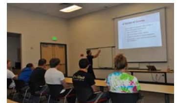
2010 CU Leadership Academy.

Over 5,300 children were taught by Boulder Fire-Rescue in 2010.