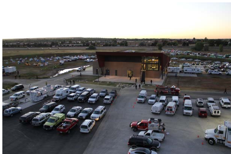
Boulder County Fire Training Center being used as the command post for the Fourmile Fire. (September 6, 2010)