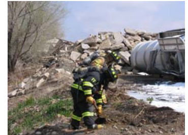
Hazardous Materials training.

Fire crews spent over 10,000 hours training in 2010.