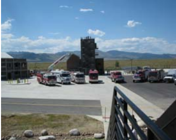
Boulder County Fire Training Center Ribbon Cutting.

The Boulder County Fire Training Center's Ribbon Cutting was on July 26, 2010.