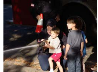
Education outreach at Oneida Street Neighborhood block party.

Over 5,300 children were taught by Boulder Fire-Rescue in 2010.