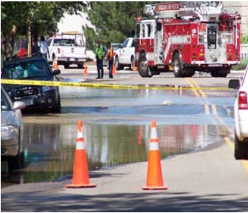
Water main break.

More than 70 Boulder Firefighters participated in efforts to extinguish the Fourmile and Dome fires.