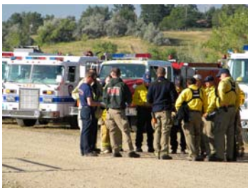
Mutual Aid Response to the Four-mile Fire in September 2010.