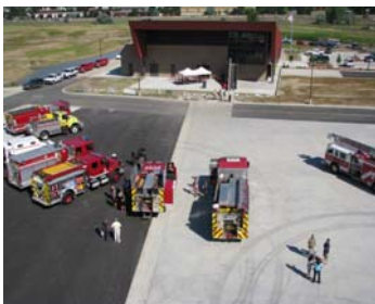
Classroom building at the Boulder County Fire Training Center.

The Boulder County Fire Training Center's Ribbon Cutting was on July 26, 2010.