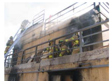
Live fire training.

Fire crews spent over 10,000 hours training in 2010.