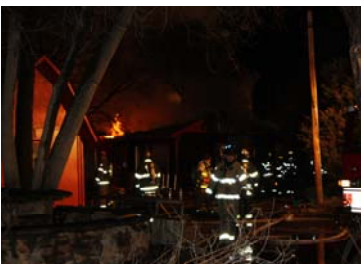
Mutual Aid Response to a house fire in Boulder Rural Fire Protection District's jurisdiction.